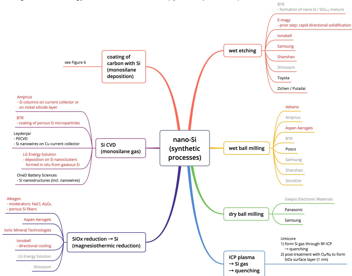
Figure 3: technology decision tree – nano-Si (synthetic processes)

17 additional decision trees & further discussions are included in the full review.